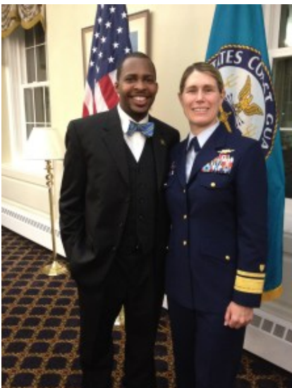
With the USCG