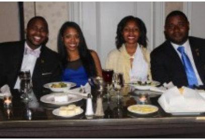
Region 1 FRC Banquet