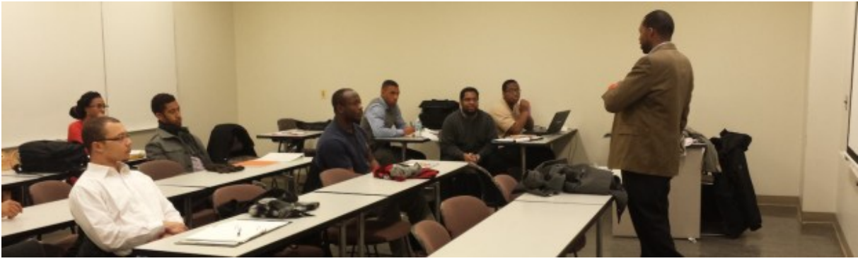
2014 Northern Illinois Univ. (Region 4) Chapter Visit