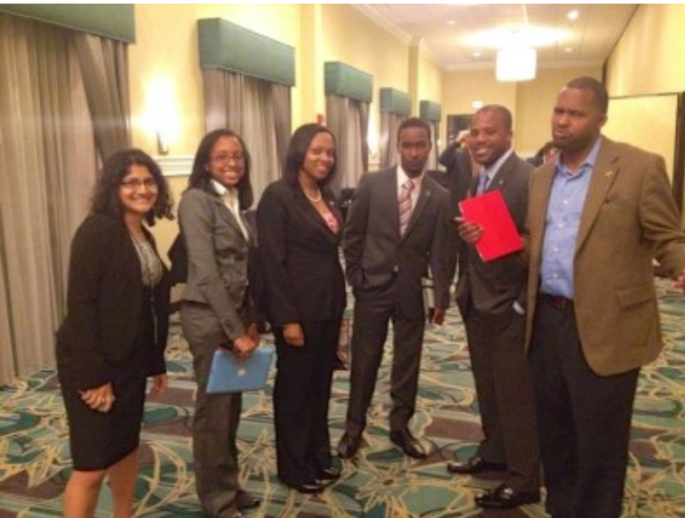
2012 Region 2 RLC, hanging out with the deuce!