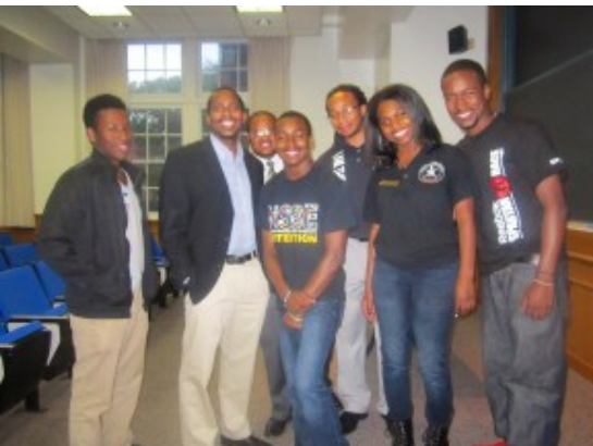
2013 Region 2 End Zone