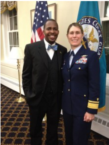
With the USCG