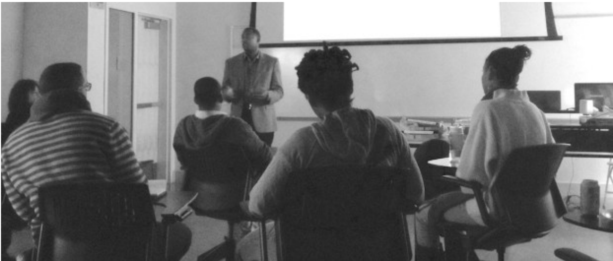
2012 Univ. of California Merced Chapter Visit. giving them my NSBE story and talking about the importance of helping others