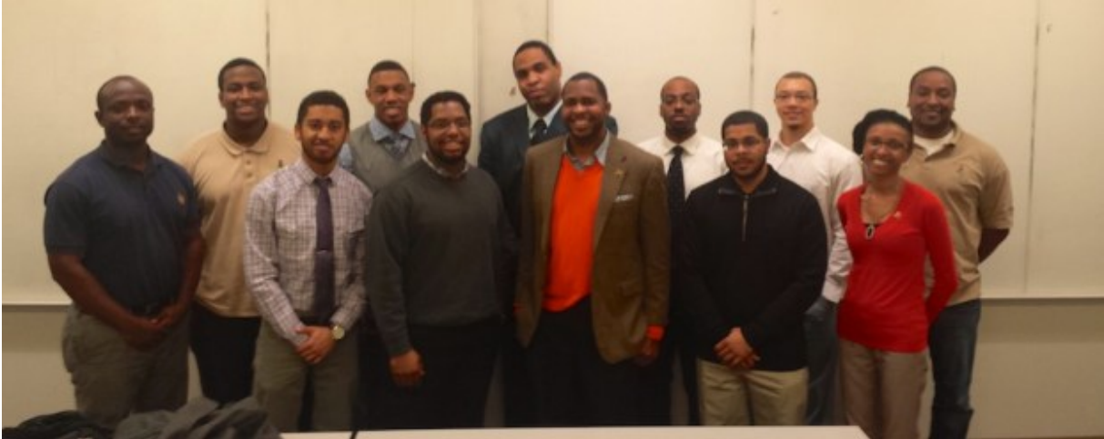
2014 Northern Illinois Univ. (Region 4) Chapter Visit. I had so much fun here