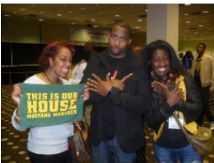
Hanging out with NSBE Cal Poly SLO